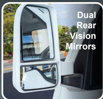
Dual Rear Vision Mirrors