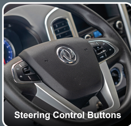
Steering Control Buttons