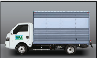
Also available in Aluminum Box

The Dongfeng EV35 cab & chassis truck. Offers a large volume cargo space, long range and a high carrying capacity that can drive your transportation business