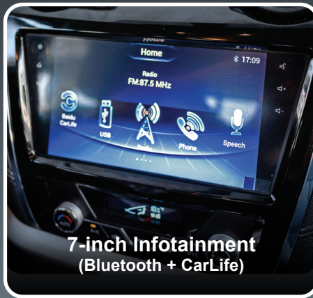
7-inch Infotainment (Bluetooth + CarLife)