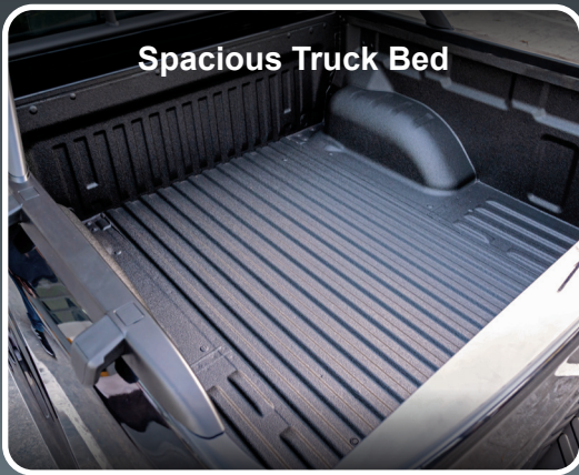
Spacious Truck Bed