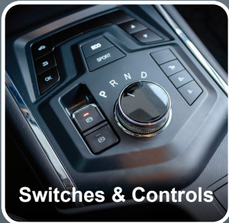
Switches & Controls