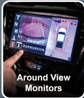
Around View Monitors