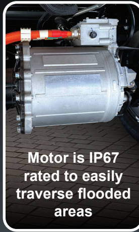
Motor is IP67 rated to easily traverse flooded areas