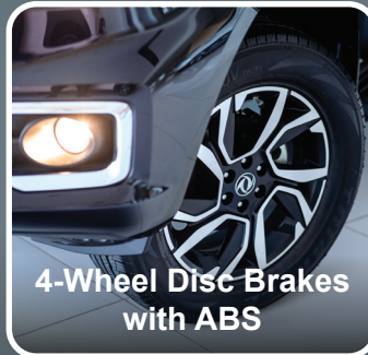
4-Wheel Disc Brakes with ABS