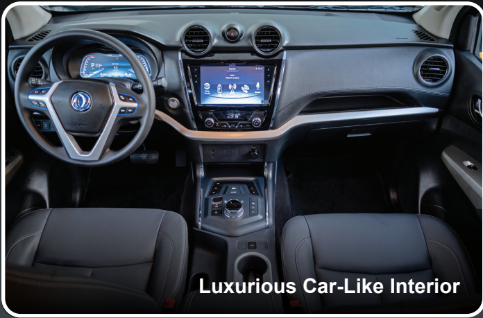
Luxurious Car-Like Interior