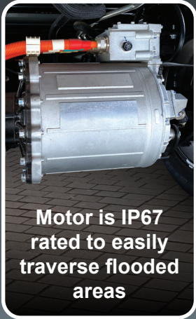
Motor is IP67 rated to easily traverse flooded areas