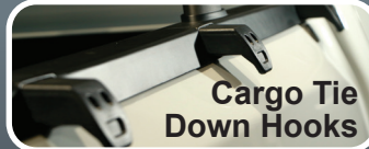
Cargo Tie Down Hooks