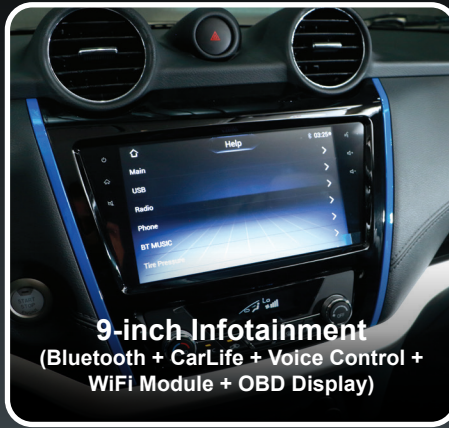
9-inch Infotainment (Bluetooth + CarLife + Voice Control + WiFi Module + OBD Display)