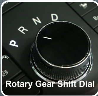
Rotary Gear Shift Dial