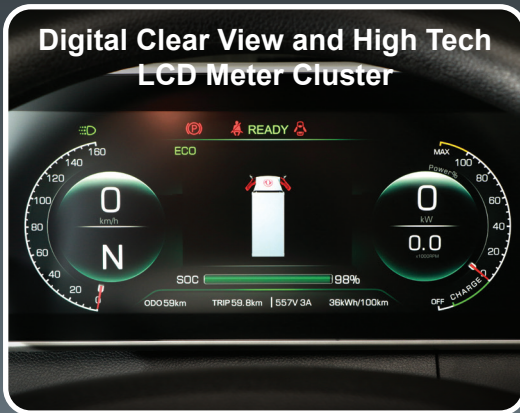
Digital Clear View and High Tech LCD Meter Cluster