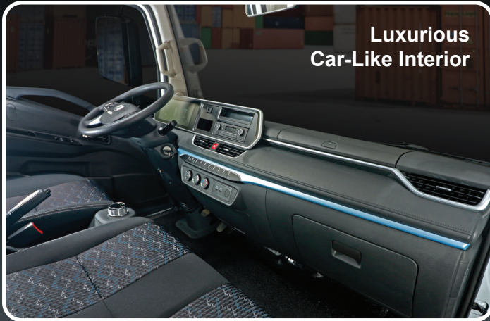
Luxurious Car-Like Interior