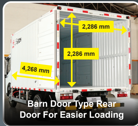
Barn Door Type Rear Door For Easier Loading