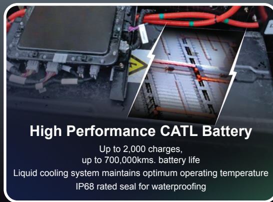
High Performance CATL Battery

Up to 2,000 charges, up to 700,000kms. battery life Liquid cooling system maintains optimum operating temperature IP68 rated seal for waterproofing