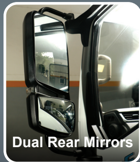
Dual Rear Mirrors