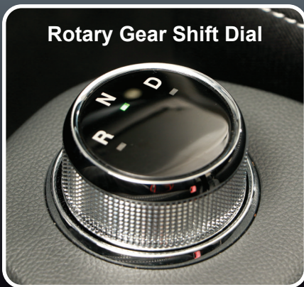
Rotary Gear Shift Dial