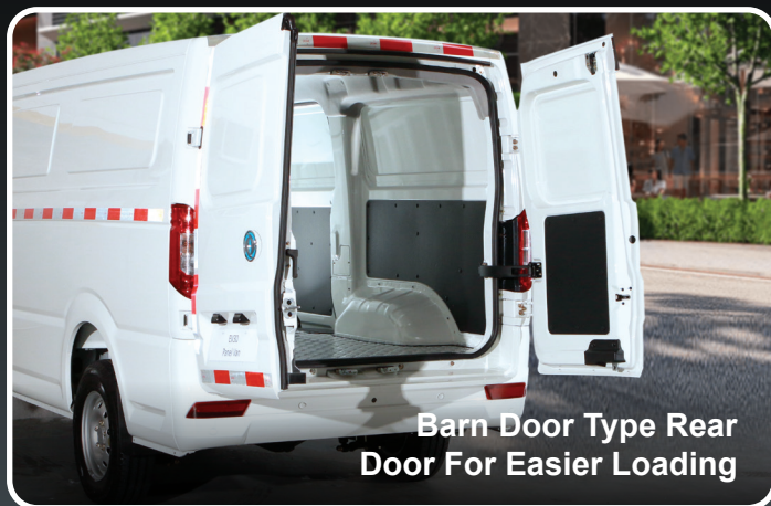
Barn Door Type Rear Door For Easier Loading