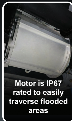
Motor is IP67 rated to easily traverse flooded areas