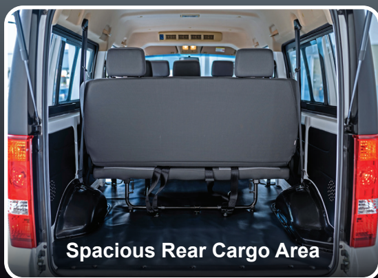
Spacious Rear Cargo Area