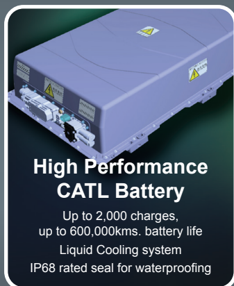
High Performance CATL Battery

Up to 2,000 charges, up to 600,000kms. battery life Liquid Cooling system IP68 rated seal for waterproofing