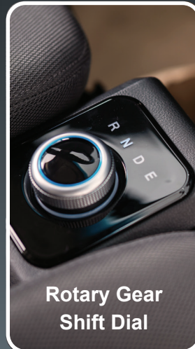
Rotary Gear Shift Dial