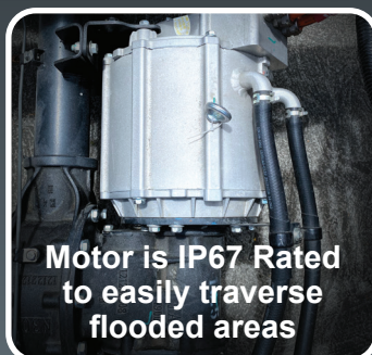
Motor is IP67 Rated to easily traverse flooded areas