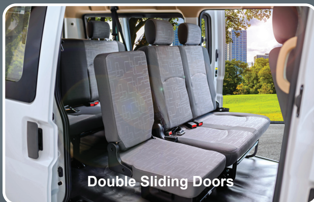
Double Sliding Doors

Up to 2,000 charges, up to 600,000kms. battery life Liquid Cooling system IP68 rated seal for waterproofing