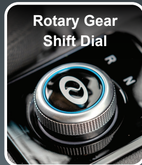
Rotary Gear Shift Dial