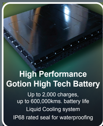
High Performance Gotion High Tech Battery

Up to 2,000 charges, up to 600,000kms. battery life Liquid Cooling system IP68 rated seal for waterproofing