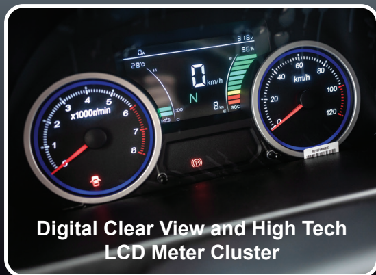
Digital Clear View and High Tech LCD Meter Cluster