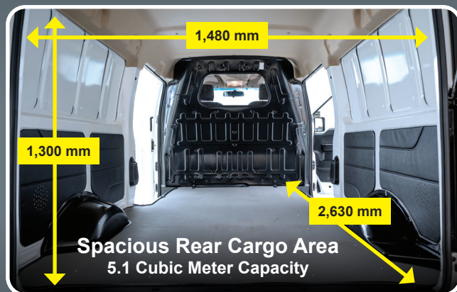
Spacious Rear Cargo Area 5.1 Cubic Meter Capacity

Up to 2,000 charges, up to 600,000kms. battery life Liquid Cooling system IP68 rated seal for waterproofing