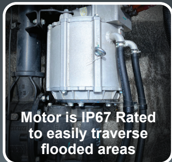
Motor is IP67 Rated to easily traverse flooded areas