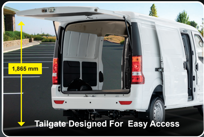
Tailgate Designed For Easy Access