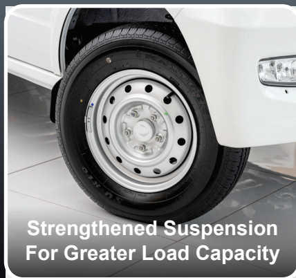
Strengthened Suspension For Greater Load Capacity