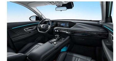
Vast Ocean Star